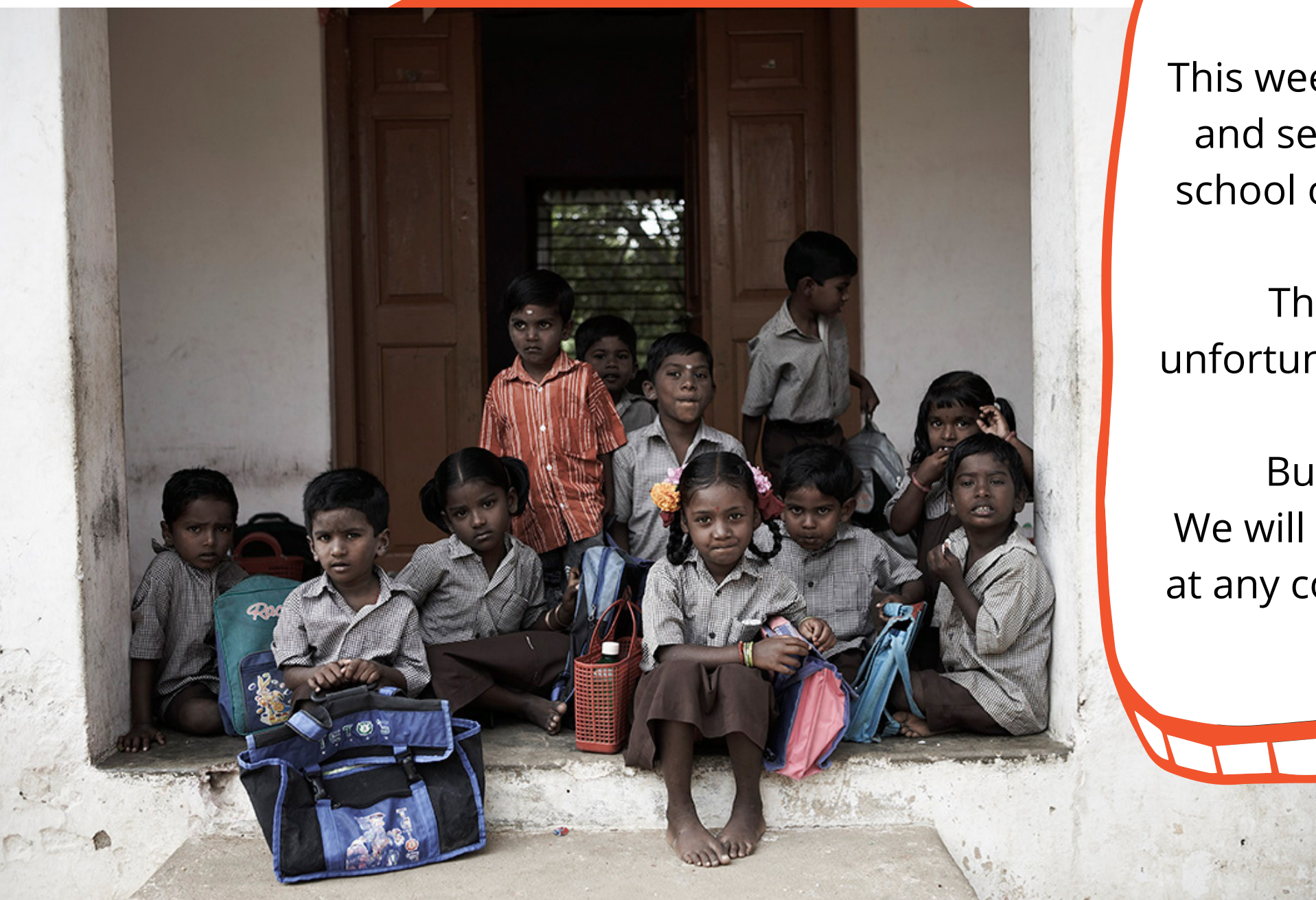
Vedanthangal Nursery School