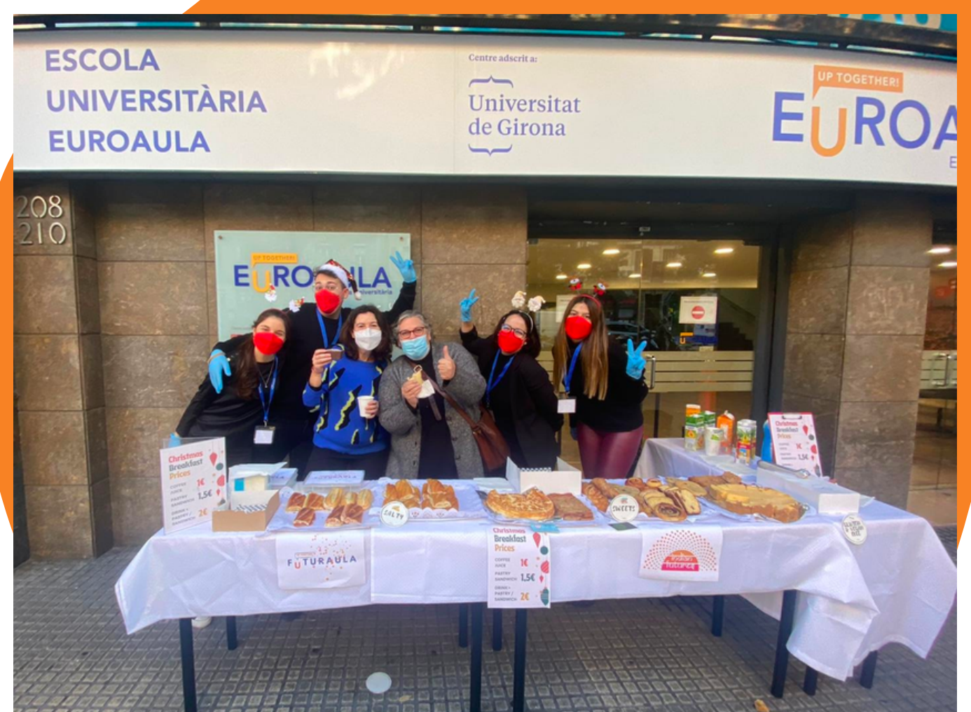
Some of the Futuraula Committee members with teachers from Euroaula, University School of Tourism