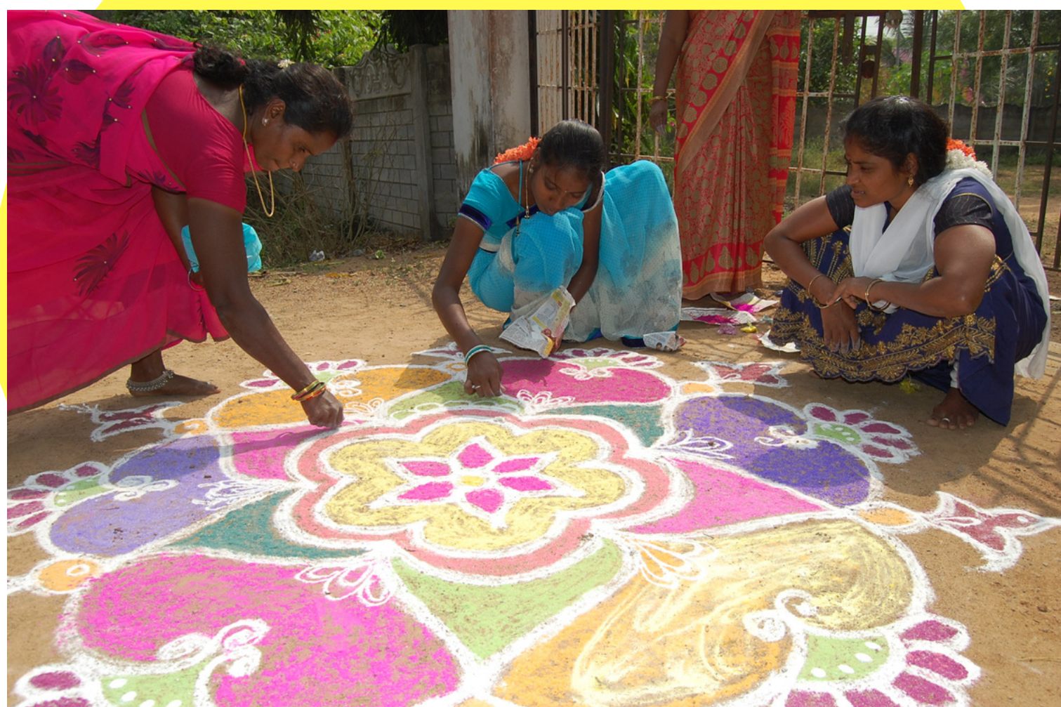
Three teachers from Laia Foundation's after-school centres drawing a kolam for Pongal